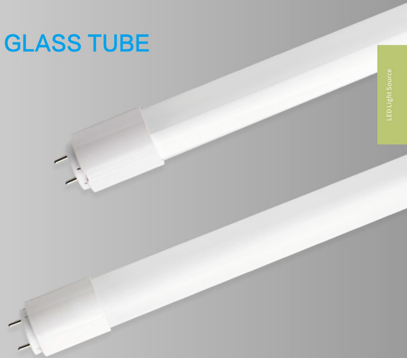
Double-powered LED Tube T8's replacement step for lamp bracket of inductive ballast